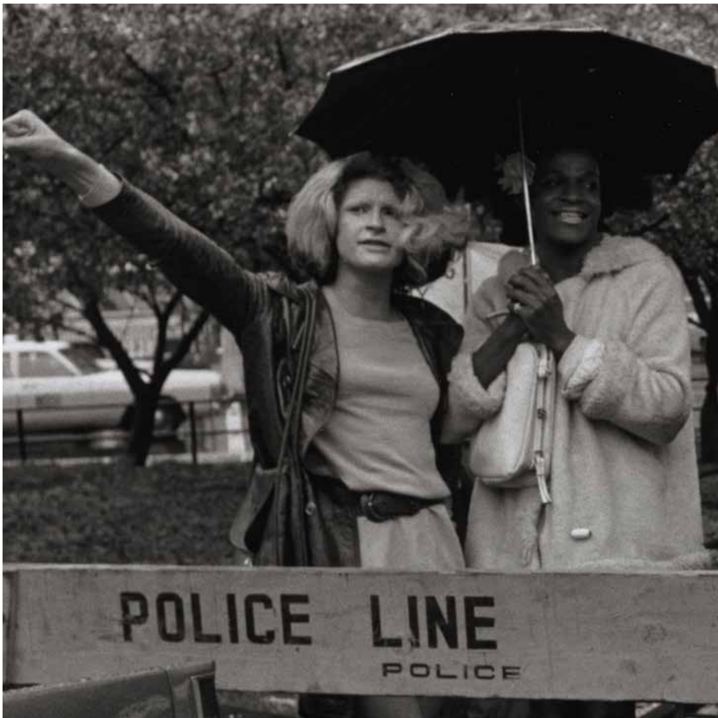
Sylvia Rivera und Marsha Johnson beim Demonstrieren